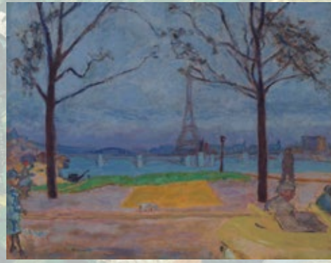
Pierre Bonnard Il Pont de Grenelle e la Tour Eiffel, ca. 1912