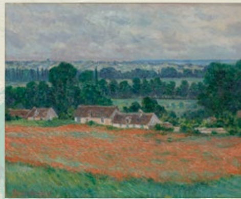
Claude Monet Campo di papaveri, Giverny, 1885