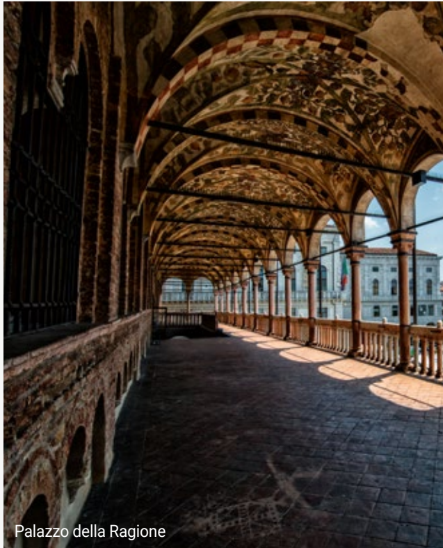
Palazzo della Ragione