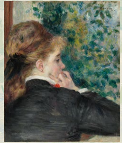
Pierre-Auguste Renoir Pensierosa (La Songeuse), 1875

Degas, Delacroix, Monet, Picasso, van Gogh and other maestros such as Géricault, Renoir, Cezanne, Matisse, Utrillo bring the magic, allure and elegance of an unrepeatable season of French art to Padua.