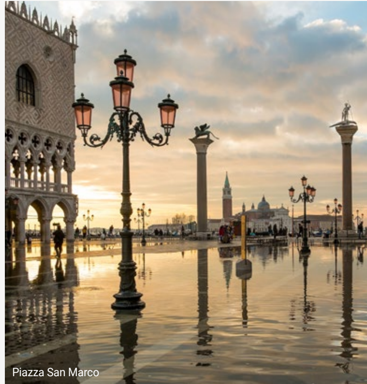
Piazza San Marco