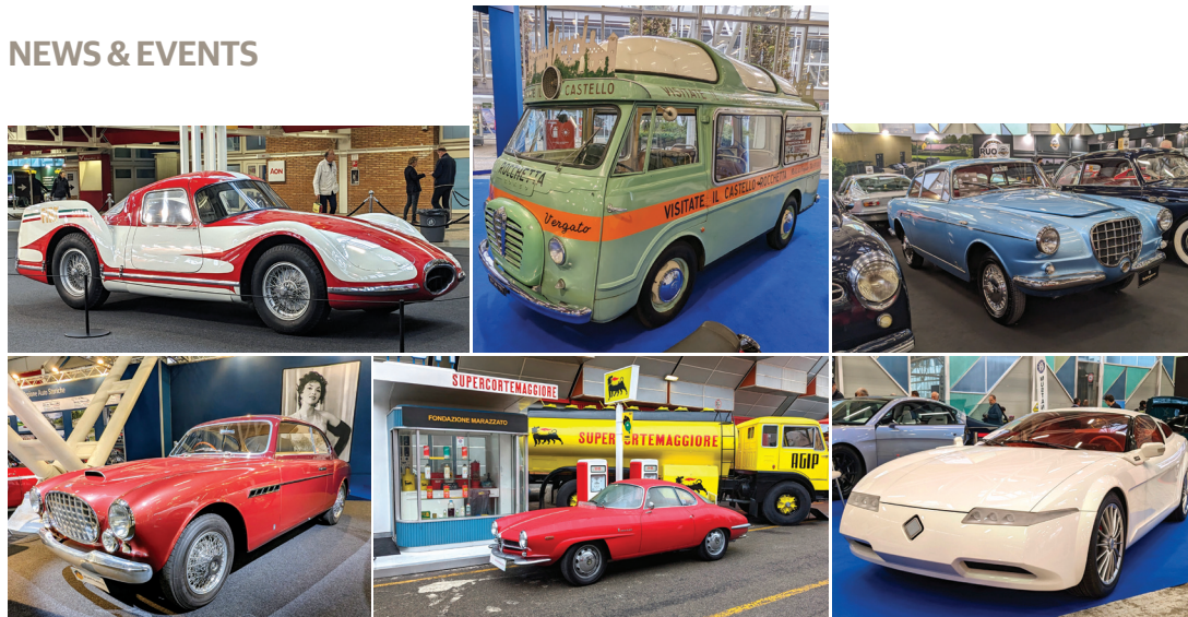
Clockwise from top left: wild Fiat Turbina; Alfa F12 tour bus; Fiat 1100 Desirée; Stola Diamante; Alfa SS; ex-Loren B52